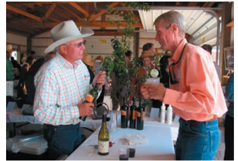
Weed Fundraiser - August 2007