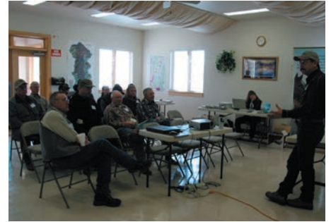
Weed Summit - March 2007