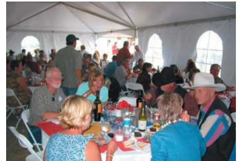
Weed Fundraiser- August 2007